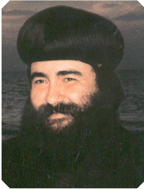
His Grace Bishop Youannes General Bishop and the Private Secretary for H.H. Pope Shenouda III