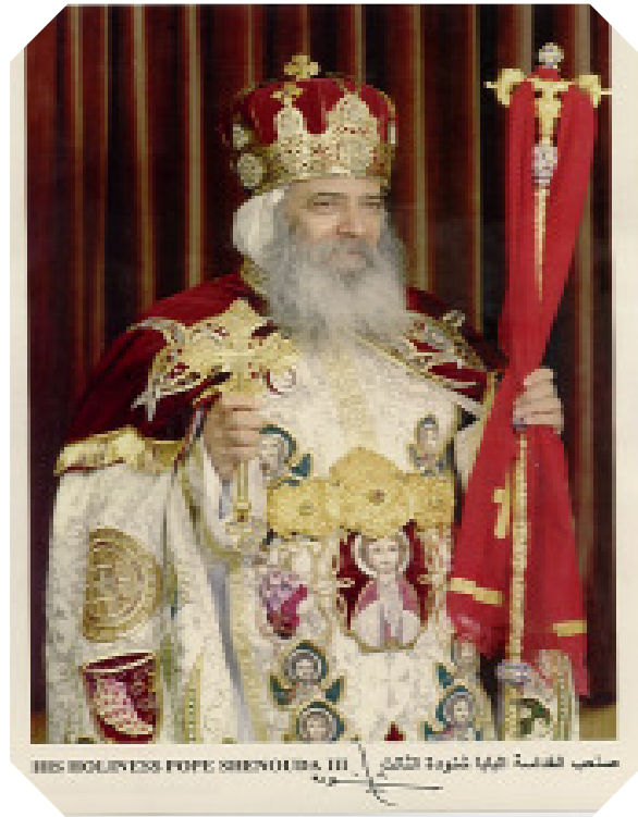
H.H. Pope Shenouda III, 117 th Pope and Patriarch of Alexandria & the See of St. Mark